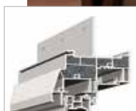
1-3/8" Set Back Nail Fin