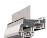
1" Set Back Nail Fin