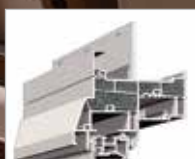
1-3/8" Set Back Nail Fin with J-channel adaptor